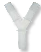
C "Y" connector