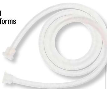
Platinum-cured silicone tubing with pre-molded 1/2" mini connections