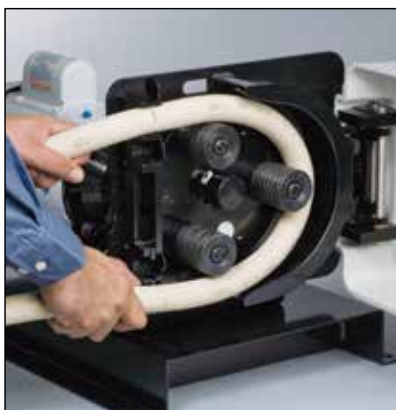
Masterflex B/T® Rapid-Load® direct drive peristaltic pumping systems provide for simple tubing changes.