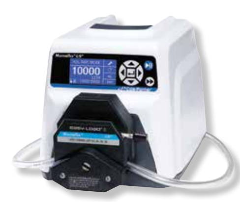
Masterflex pumps avoid chemical attack, abrasive wear and clogging, salt settlement and NaOCI vapor-locking.

Solenoid pumps may be cheap to acquire, but they're often quite expensive in terms of downtime and maintenance. However, the proven peristaltic design of Masterflex pumps provides for incredibly high suction lift - and accurate, reliable performance - without clogging, and without check valves that can jam, cause siphoning, downtime and performance and/or liability issues. Masterflex® pumps are self-priming and they can run dry for extended periods without damage. They can't become vapor-locked, either.