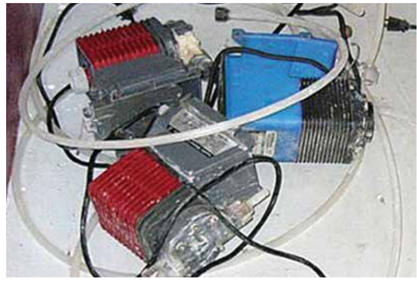
Solenoid-driven diaphragm metering pumps often become vapor-locked from NaOCI outgassing and jammed due to crystallization.